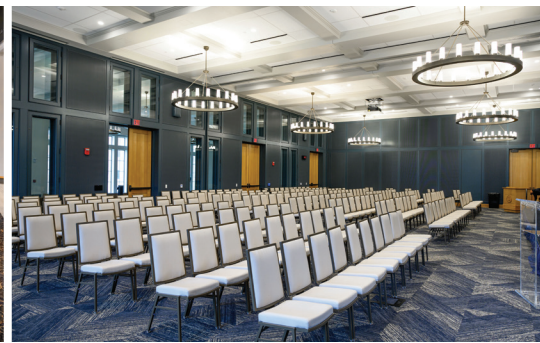
McKenna Hall // Medium Divisible Meeting Room