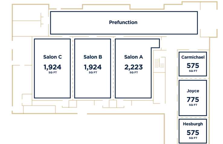
MORRIS INN // MAIN LEVEL