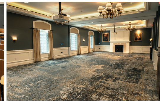
Morris Inn // Private Dining Room