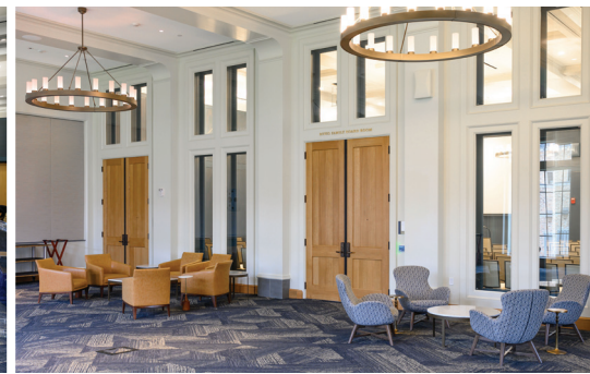
McKenna Hall // Prefunction