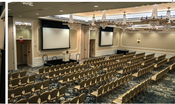
Morris Inn // Smith Ballroom