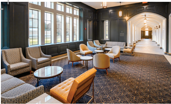
McKenna Hall // Living Room