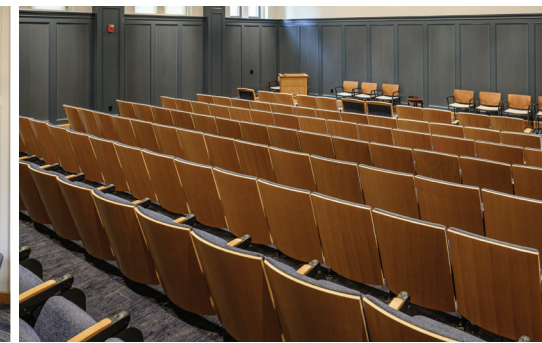
McKenna Hall // Auditorium