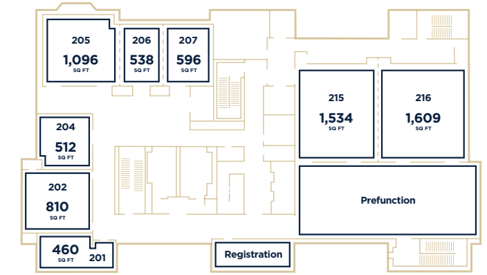
MCKENNA HALL // SECOND FLOOR